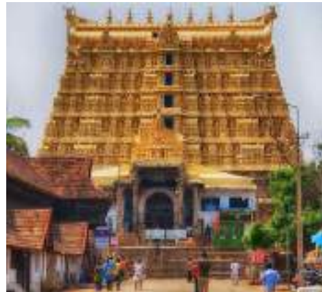
Padmanabhan Swamy Temple